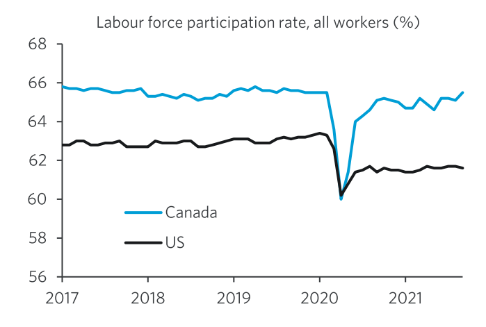
Chart: Labour market participation has recovered in Canada but remains weak in the US, pressuring American wages

So what's really mispriced is the relative path for Canadian and US rates. A scenario that has the Bank of Canada hiking five or six times next year would clearly be a strong enough economic backdrop for the Fed to hike much more than priced in. But even if we see only two hikes in Canada as in our base case, the same inflation concerns would be sufficient to get the Fed on a similar course.